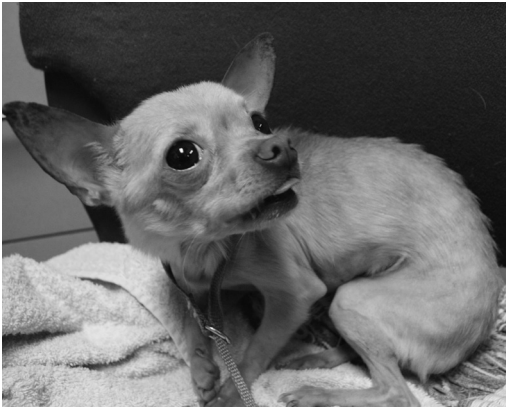
Audrey the morning she was found at KHS

nothing but swimming, spending time with friends and much-deserved relaxation on its agenda. Then – I walked into work.