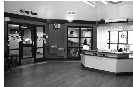
New, welcoming adoption lobby with more open space and viewing areas