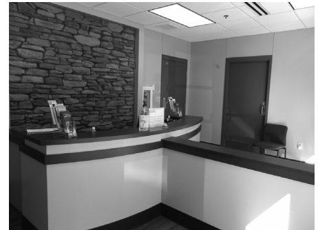
Improved admissions lobby, with separate sides for dogs and cats

We hope that you will visit the improved facility soon to see for yourself!